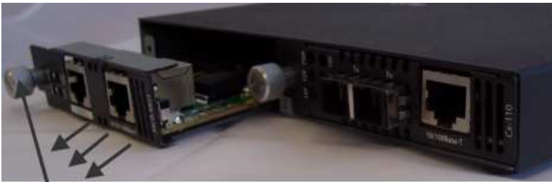
Captive retainer screw