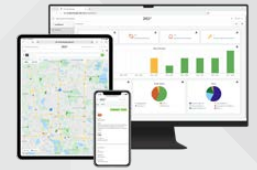
Manage this device with Digi Remote Manager