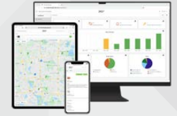
Manage this device with Digi Remote Manager