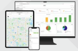
Manage this device with Digi Remote Manager