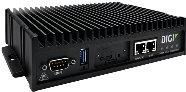
DIGI TX40 5G — FRONT