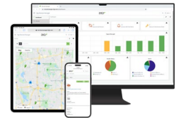
Manage and configure Digi TX40 5G with Digi Remote Manager