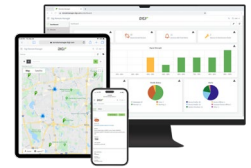
Manage and configure Digi TX40 5G with Digi Remote Manager